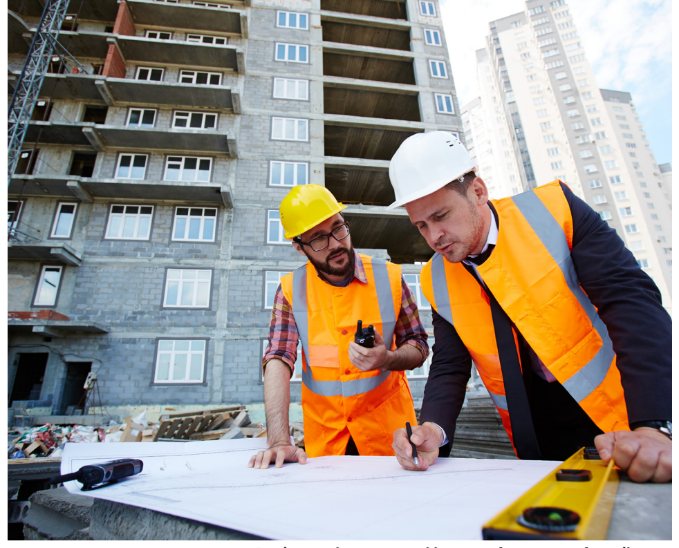
\label{pression} \textbf{Business photo created by pressfoto - www.freepik.com}